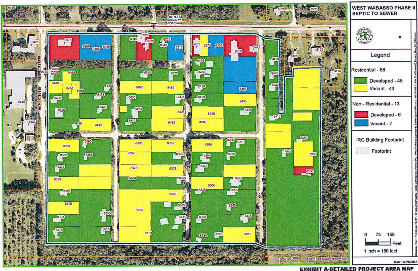
Figure 1. Detailed Project Area Map