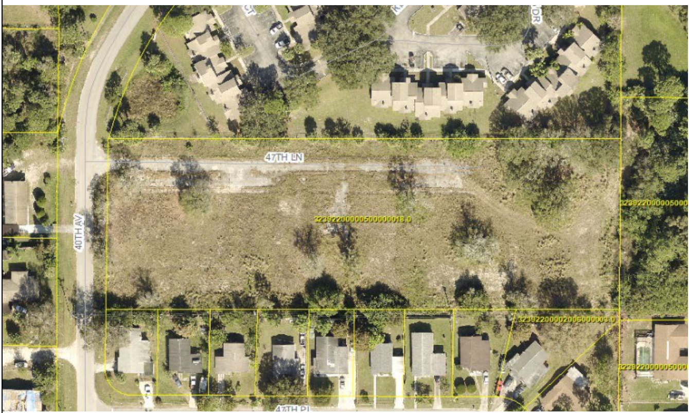
Aerial Photo, Former Gifford Gardens Site

The parcel is zoned RM-10, Residential Multi-family (up to 10 units per acre), with single-family homes allowable.