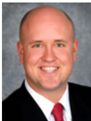
T. SPENCER CROWLEY, III Commissioner Miami-Dade County Email T. SPENCER CROWLEY, III