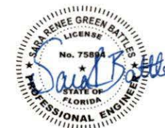
Sara R. Battles, P.E. FL PE #75894

TOTAL COST (Public Force Main): $60,956 25% 1-YEAR WARRANTY SECURITY = $15,239