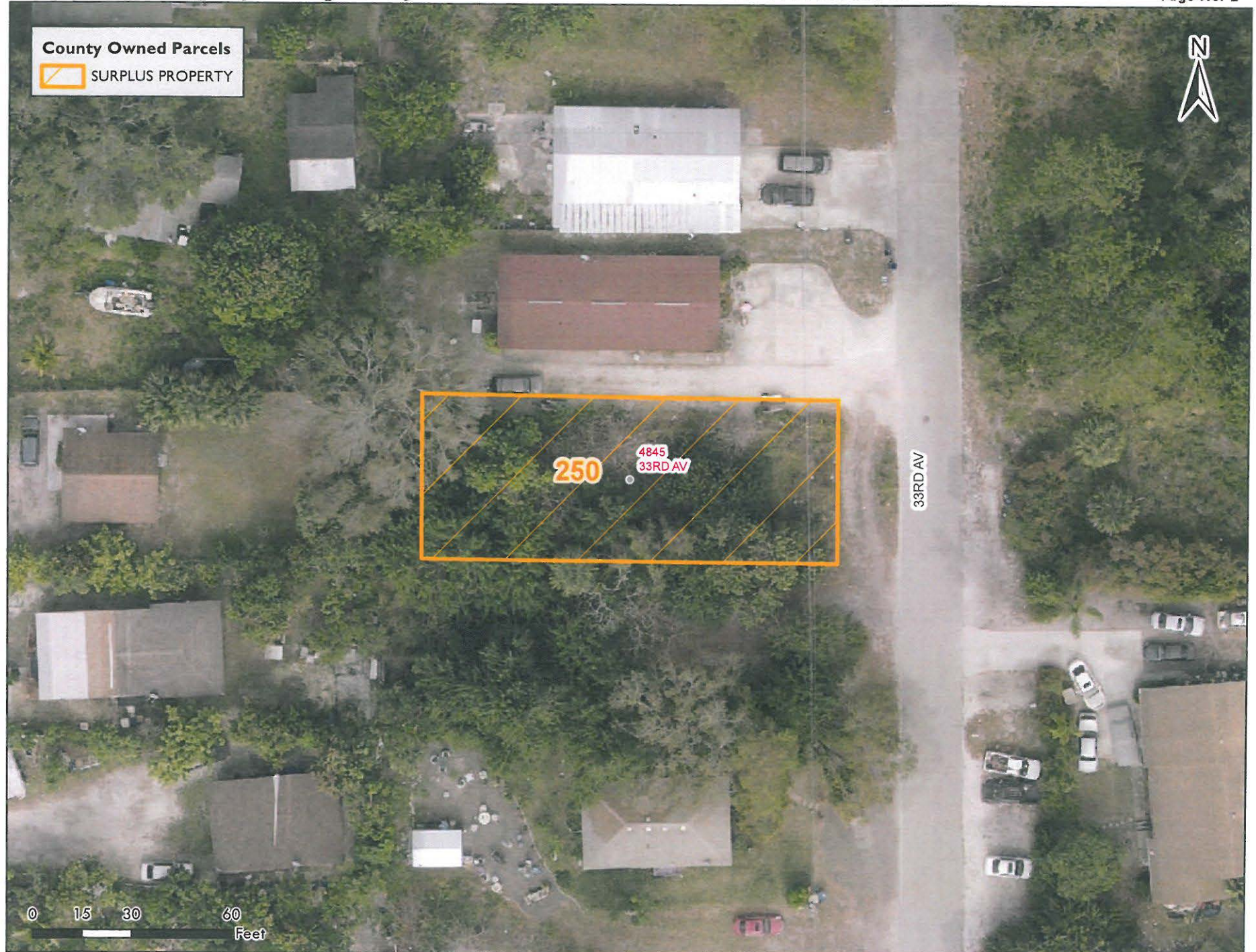
Map ID 250: SURPLUS PROPERTY: TAX DEED (UNIMPROVED LOT)