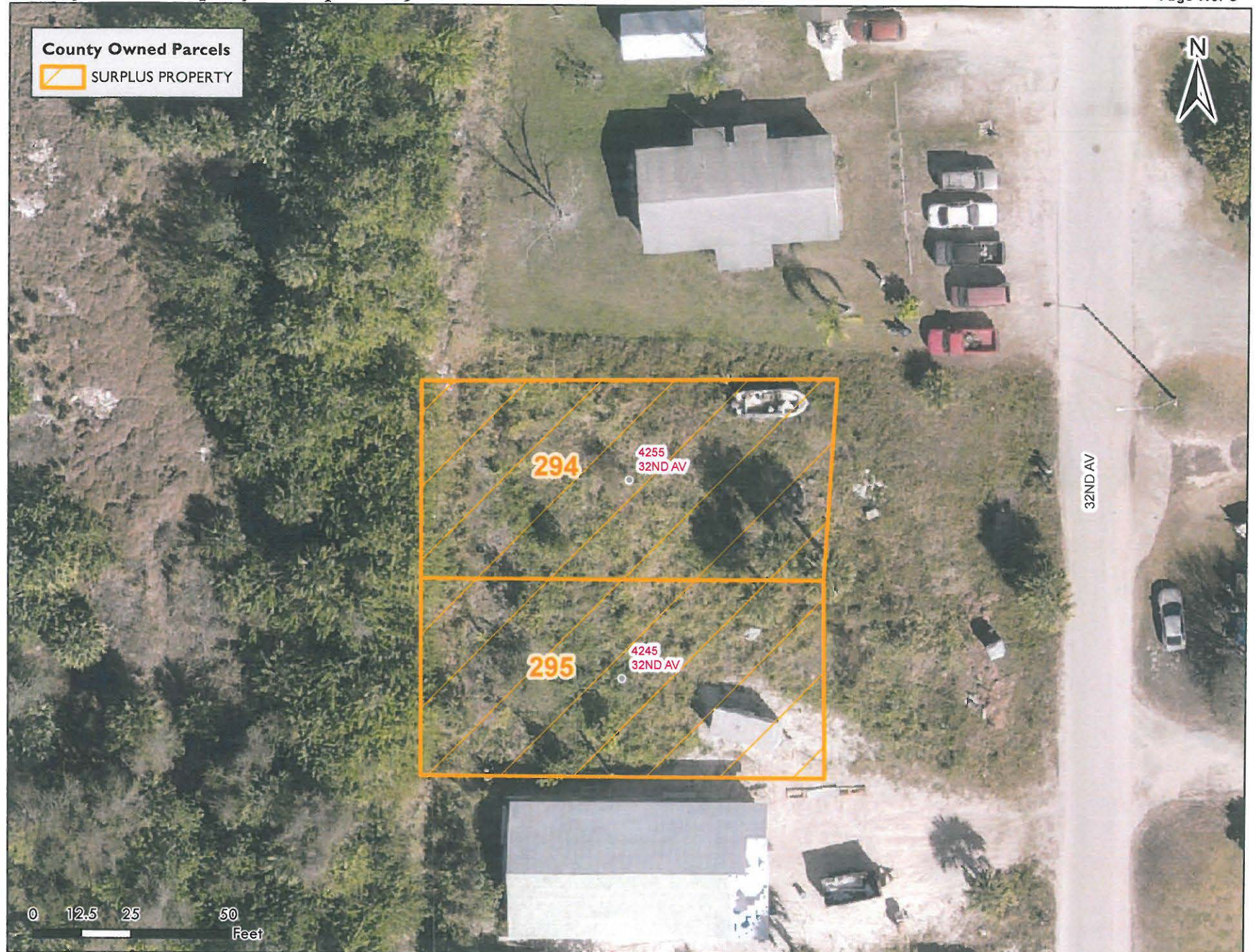
Map ID 294: SURPLUS PROPERTY: TAX DEED (VACANT LOT)