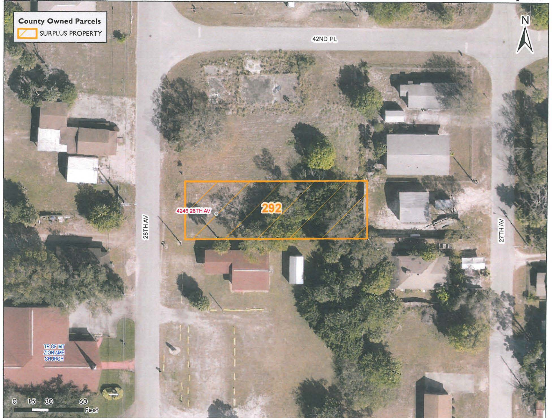
Map ID 292: SURPLUS PROPERTY: TAX DEED (VACANT LOT)