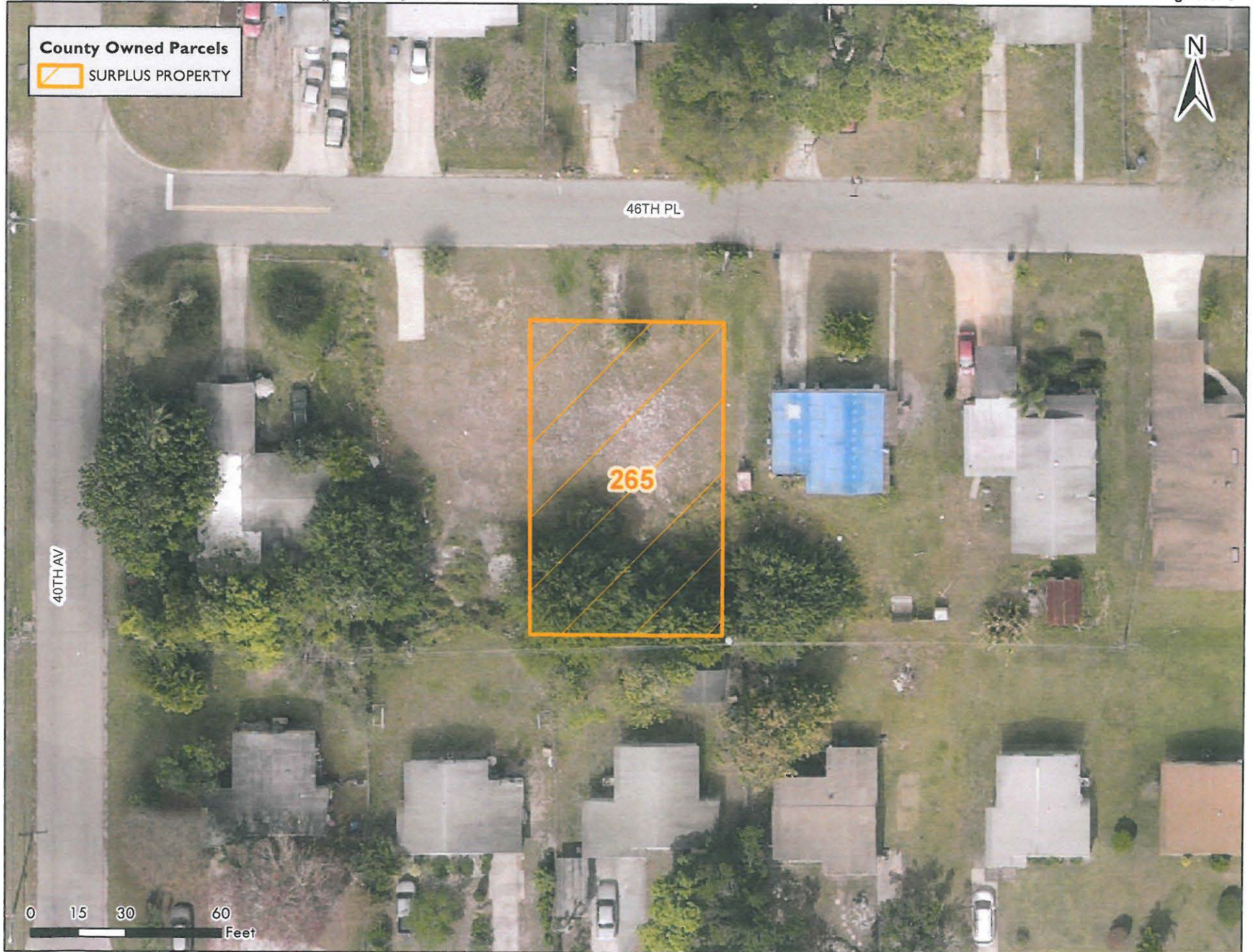
Map ID 265: SURPLUS PROPERTY: ESCHEATMENT PROPERTY (VACANT LOT)