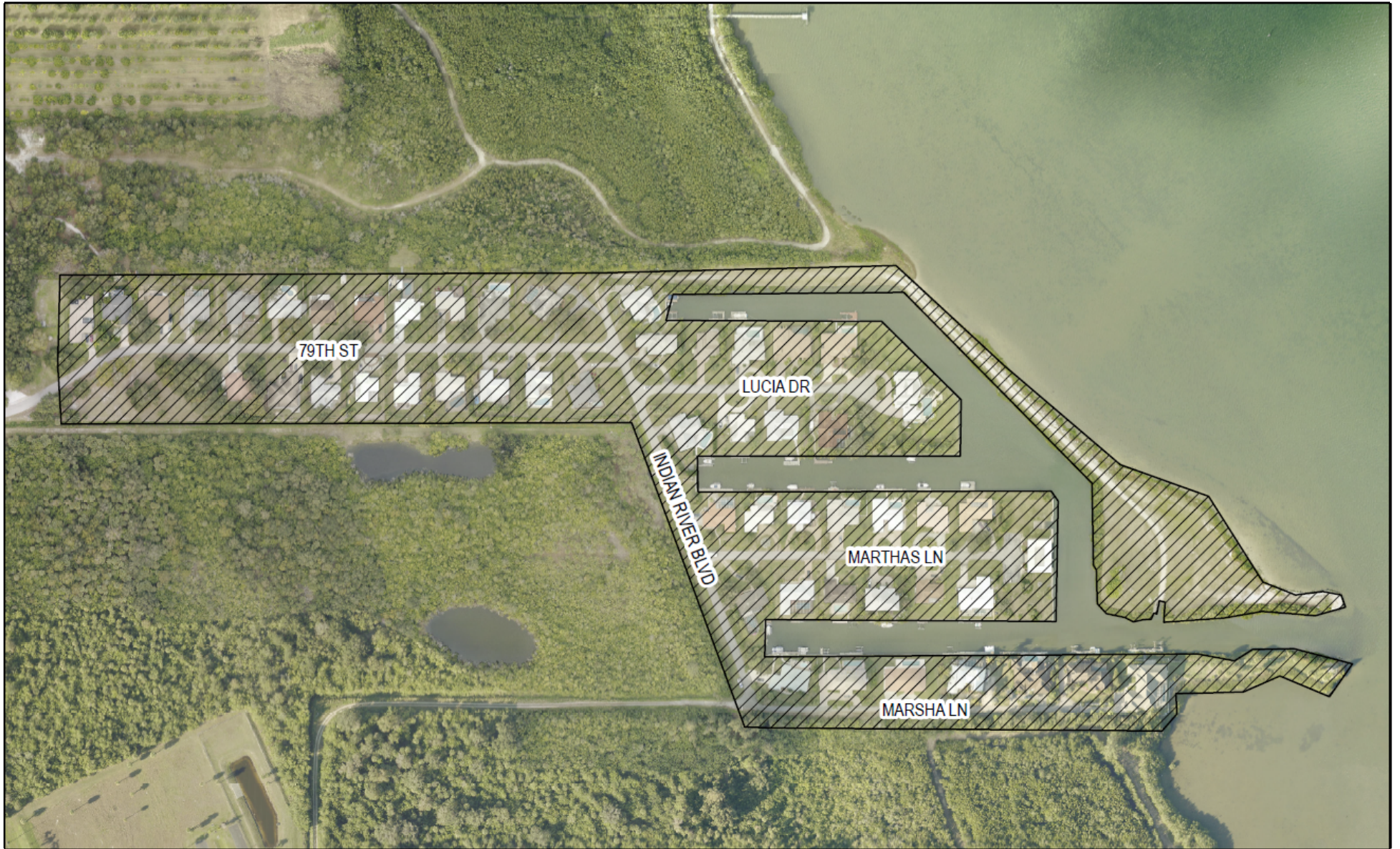
FIGURE 1 SITE MAP: