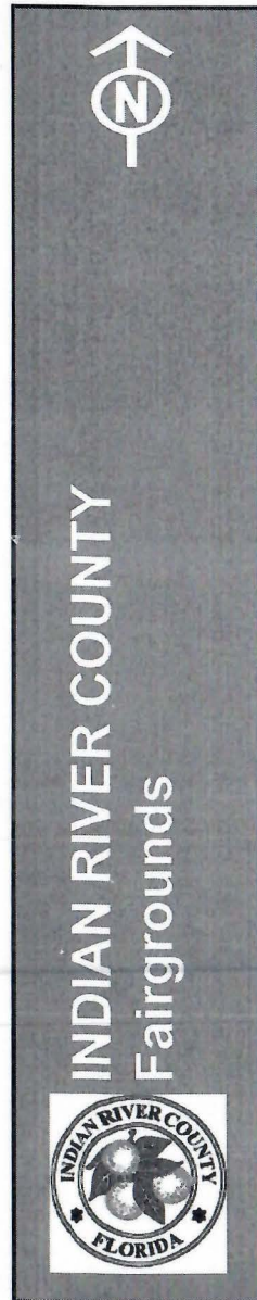
EXHIBIT A - January Home Show, 12/31/2026-1/3/2027