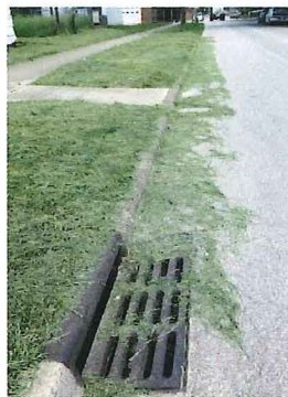
Don't leave clippings in the street.