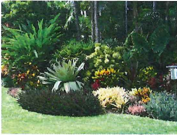
Florida Friendly lawns utilizing plants to reduce turf.

For more information on choosing the right plants or turf cover, use the plant list available through the Florida Yards and Neighborhoods program by UF/IFAS at http://ffl.ifas.ufl.edu or contact our local Extension office at 772-226-4317.