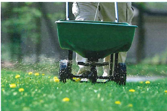
Fertilize once in the fall and once in the spring.

To reduce nutrients, fertilize just twice a year; once in the fall and once in the spring. Prevent algal growth by using a fertilizer with 0% Phosphorous (our Florida soil is naturally rich in Phosphorous so anything we add is already excess). Avoid fertilizing within 10 feet of any water body. Mulching grass clippings back into your yard should provide the needed nutrients to eliminate one fertilizer application. Never leave grass clippings in the street where they can wash to nearby water bodies and promote algal growth.