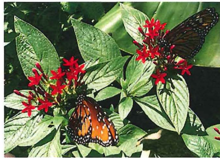
Butterflies enjoying a native fire bush.