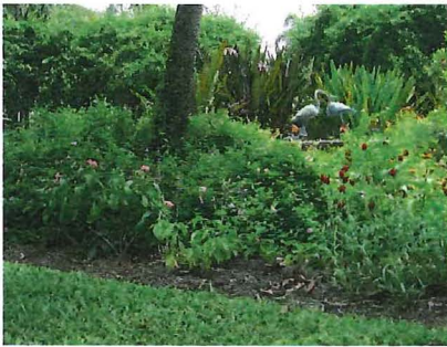
A lively butterfly garden full of FL natives.

http://gardeningsolutions.ifas.ufl.edu .