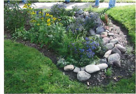
A Florida native rain garden.