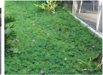
Sunshine Mimosa replacing turf.