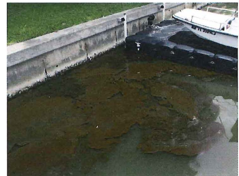
Reduce nutrients and prevent algal growth.