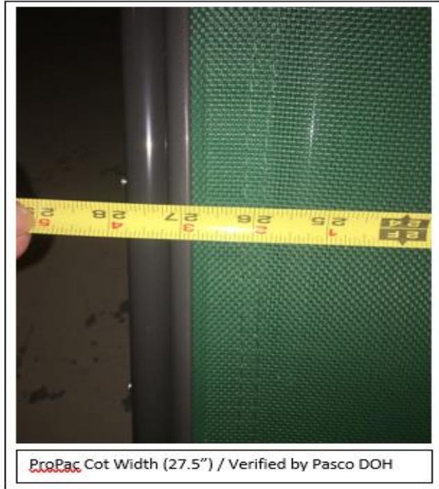
ProPac Cot Width (27.5") / Verified by Pasco DOH