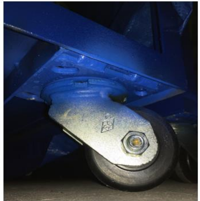
ProPac Heavy Duty Caster 1.5"