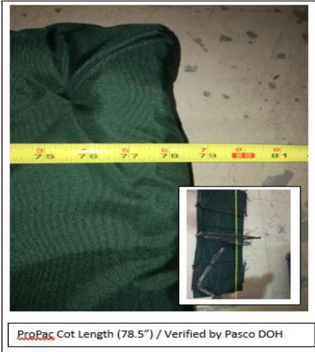
ProPac Cot Length (78.5") / Verified by Pasco DOH