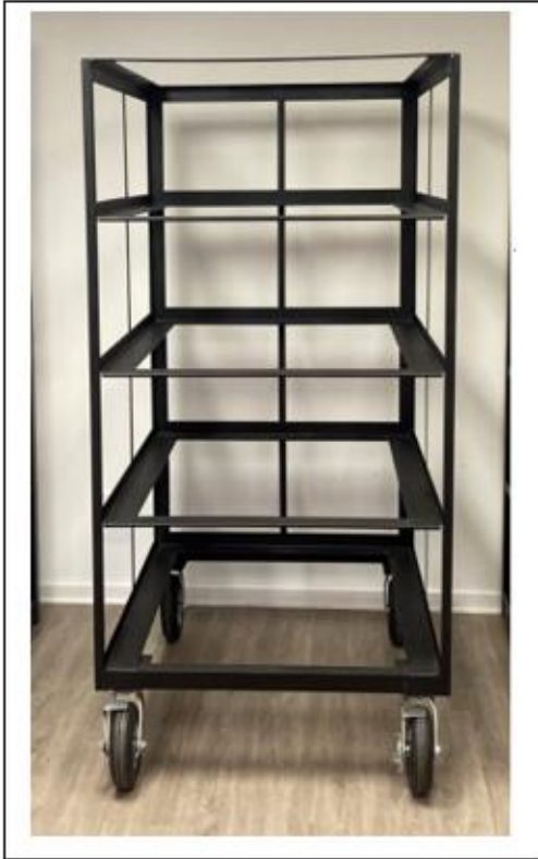
IMS Westcot AT8 = 38.5 x 42.5 x 73.25"