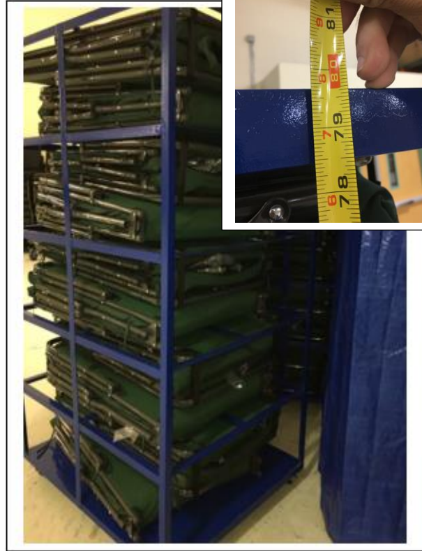
ProPac 10 Cot Cart = 79.5 x 44.5 x 38.25