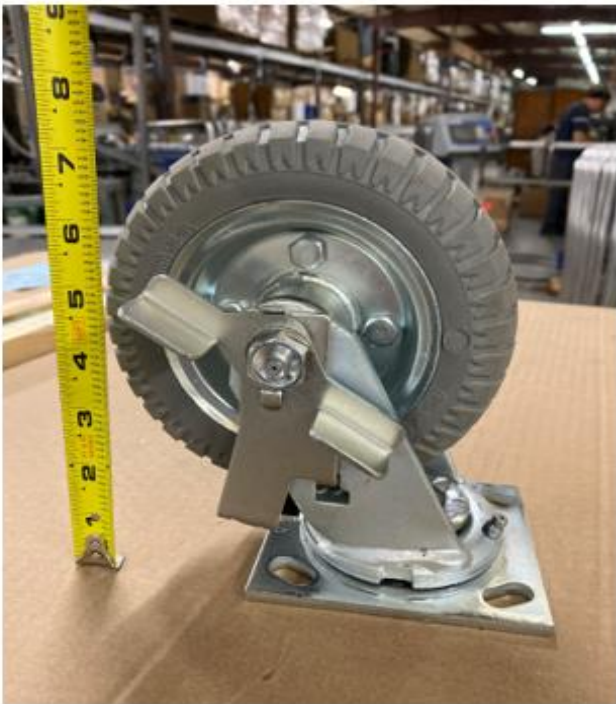
IMS Heavy Duty Caster 7.5"