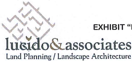
EXHIBIT "D" – LUCIDO & ASSOCIATES, INC. FEE BREAKDOWN