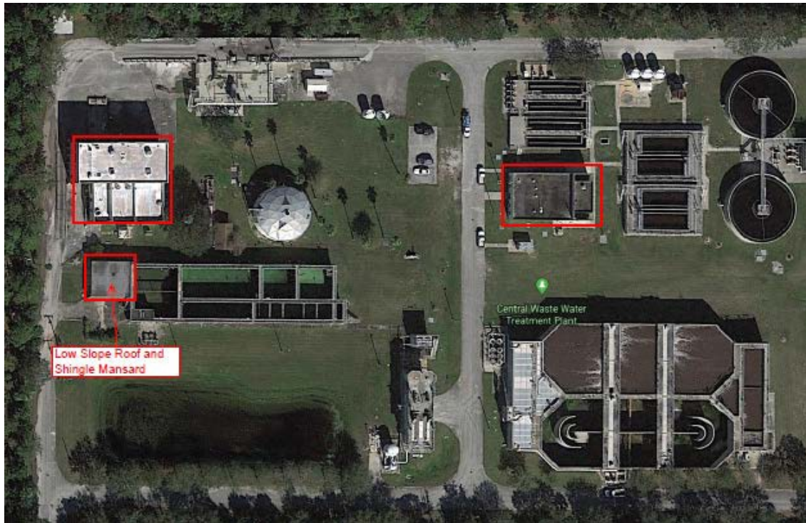
Proposed roof replacement locations noted in "red".