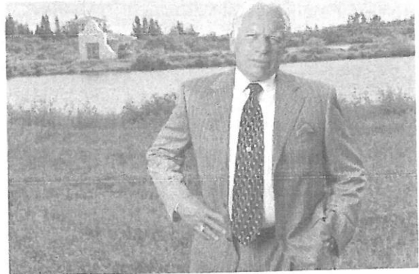
County's largest mixed-use project abandoned by funder

“I would like to see something like a Fresh Market in there along with a bunch of shops and a couple of restaurants,” Paladin says. “The shops would have office space above. It is a perfect