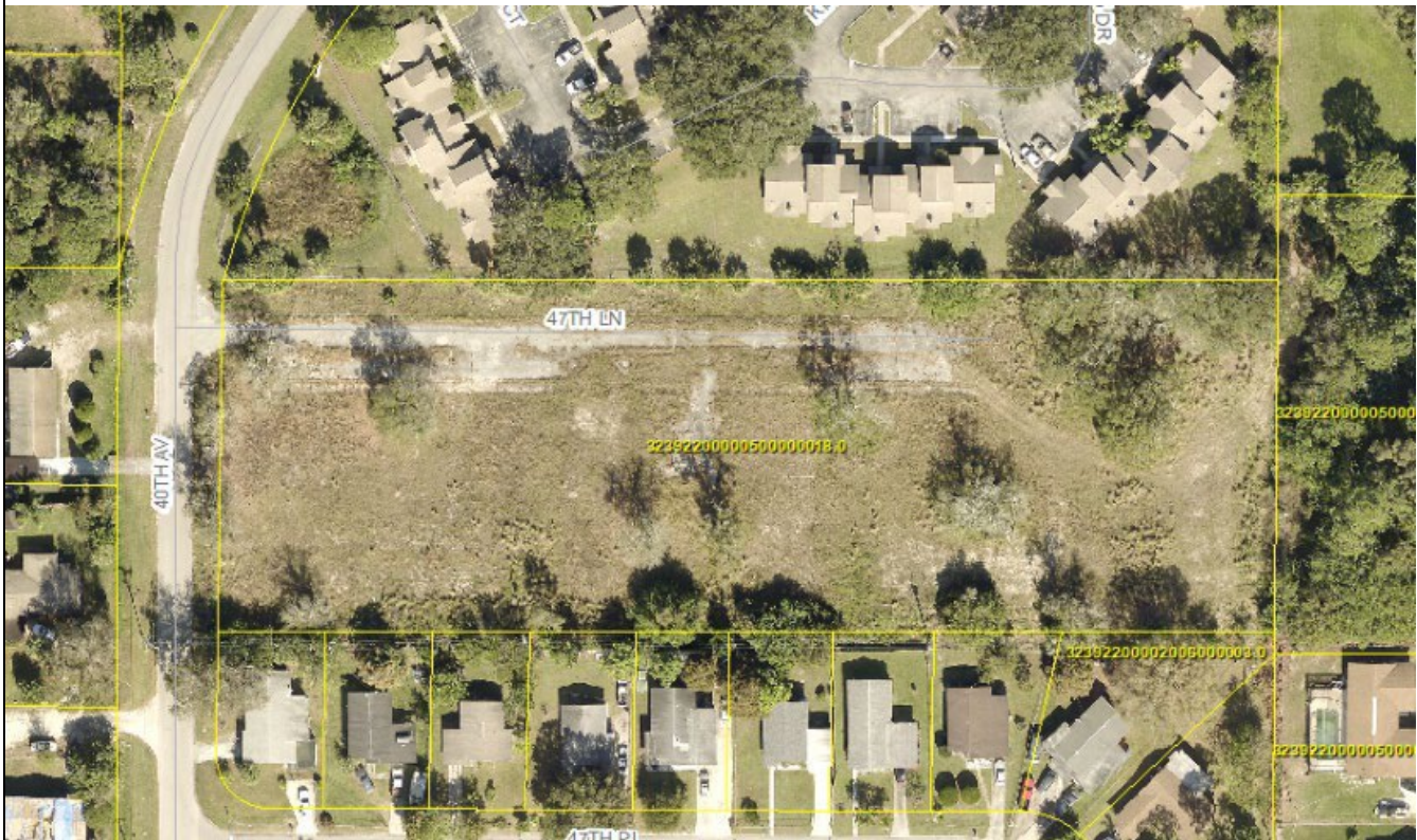
Aerial Photo, Former Gifford Gardens Site

The parcel is zoned RM-10, Residential Multi-family (up to 10 units per acre), with single-family homes allowable.