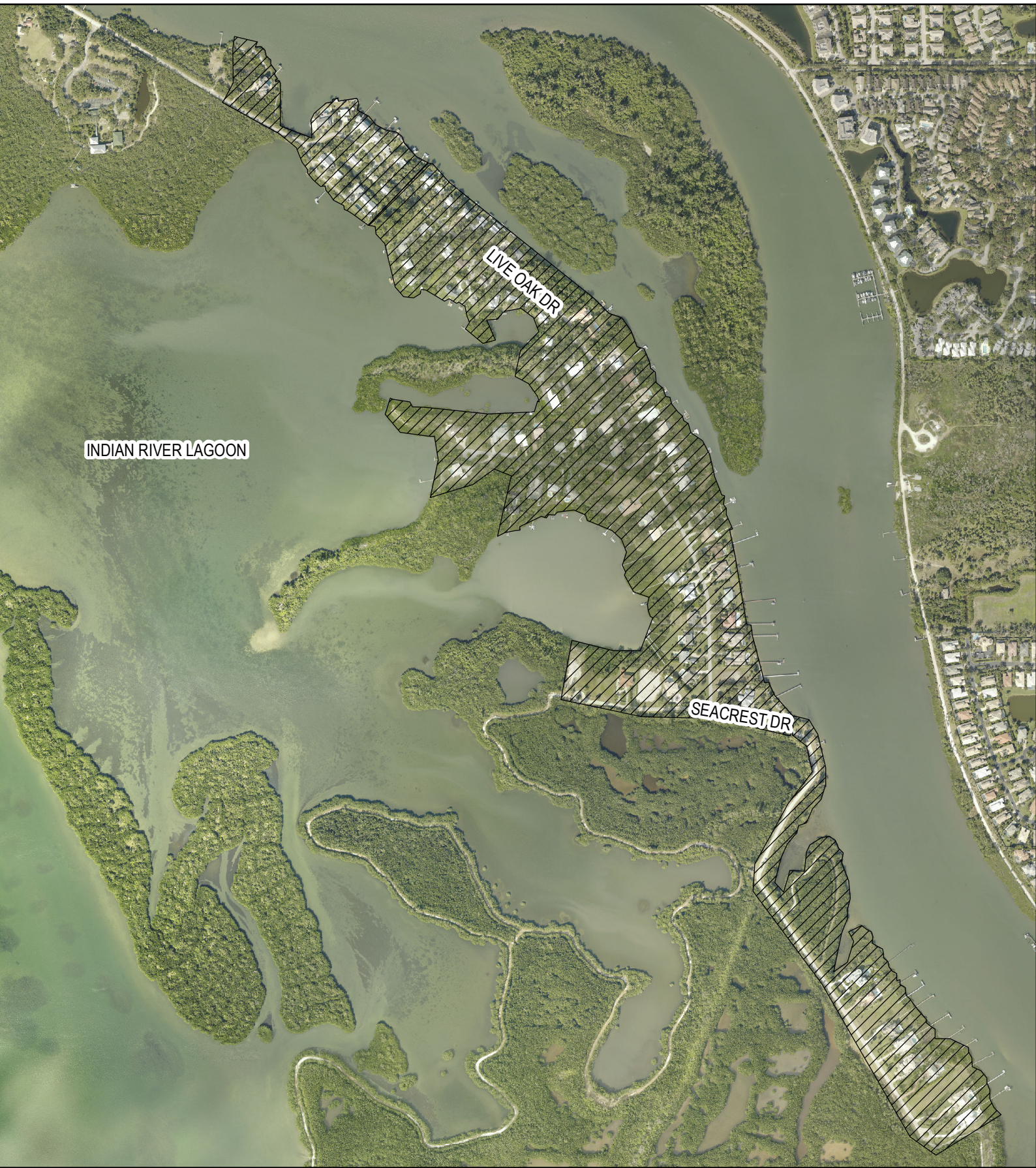
FIGURE 1 SITE MAP: