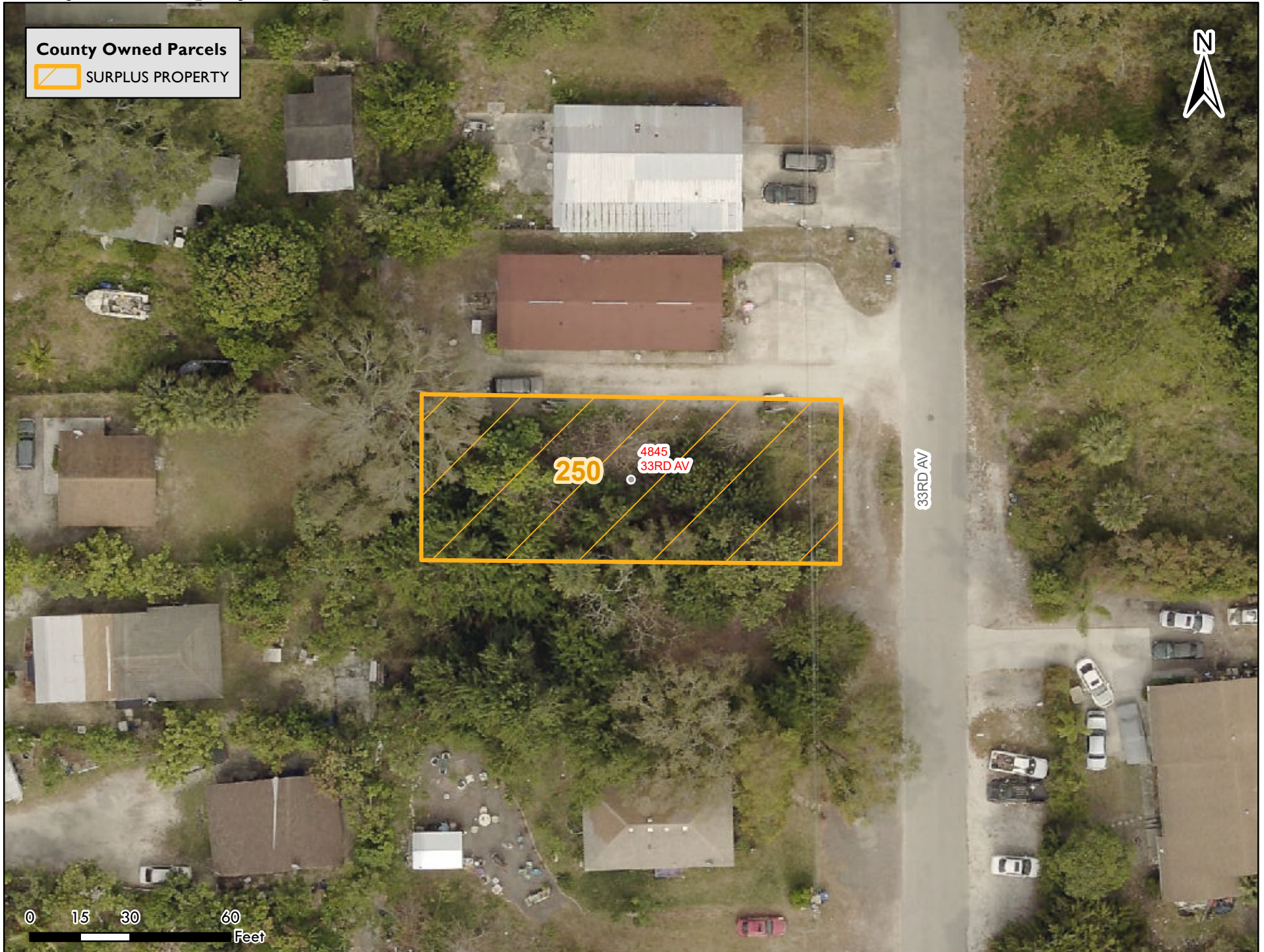
Map ID 250: SURPLUS PROPERTY: TAX DEED (UNIMPROVED LOT)