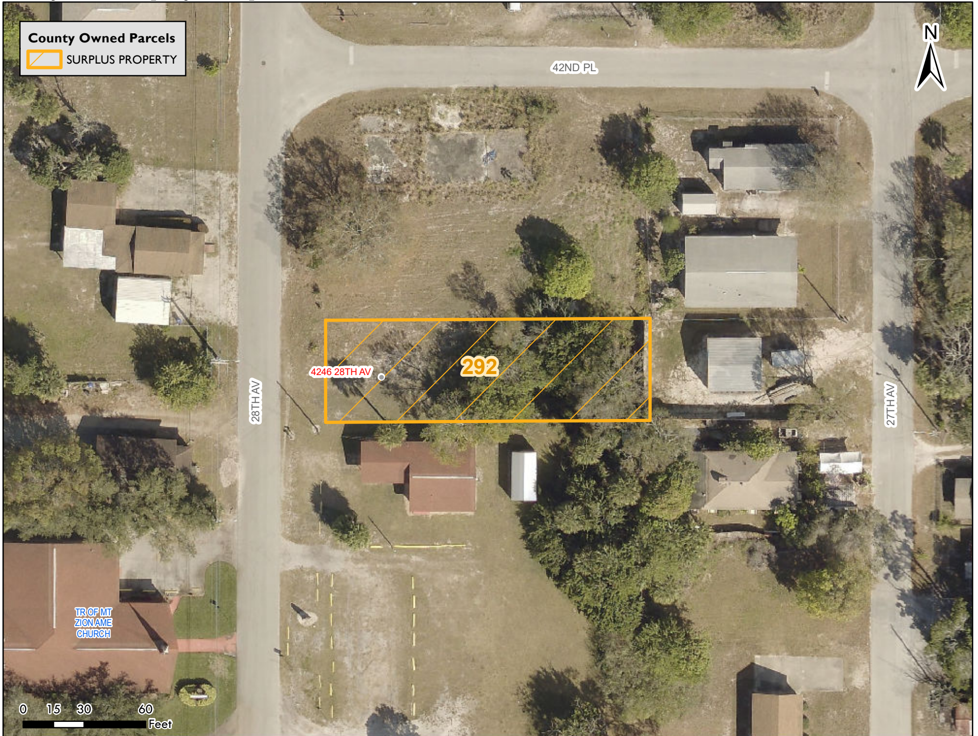
Map ID 292: SURPLUS PROPERTY: TAX DEED (VACANT LOT)