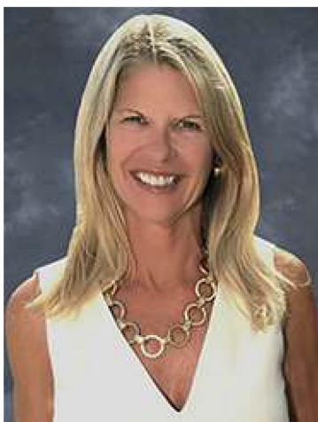
Senator Debbie Mayfield District 17