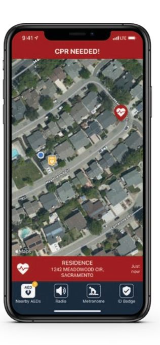
By invitation only. See feature matrix for a complete product comparison.