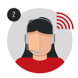
911 center initiates PulsePoint alert.