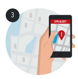
Nearby PulsePoint subscribers alerted simultaneously with emergency responders.